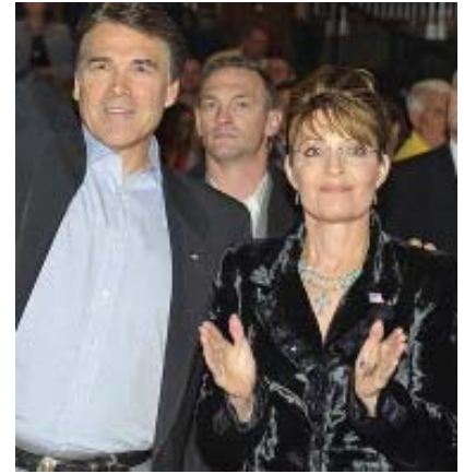
Former Alaska Gov. Sarah Palin endorsed Texas Gov. Rick Perry in the March 2 Republican primary race. There's talk about a Perry/Palin ticket for the 2012 presidential election.

Gubernatorial candidate Bill White responded: "After 25 years in political